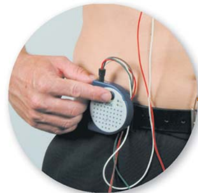
Heart 2006™/2005A™ Single/Dual lead transtelephonic ECG loop event recorder/transmitter