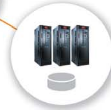
Database (Patient Records)