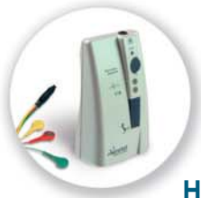
HeartView P-12/8 Plus BT™