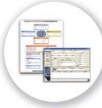
Aerotel LifeCare Center