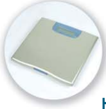
High Precision Scale