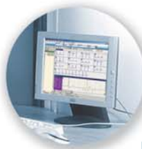
HeartLine™ Receiving Station