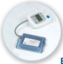
Blood Pressure Meter