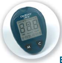
Blood Glucose Meter