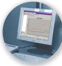
MPM™ Call Center