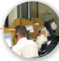
Call Center Systems